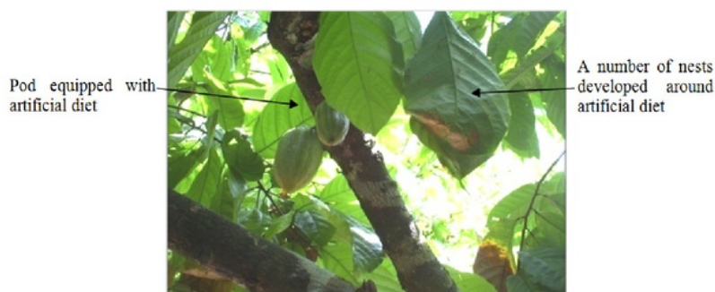
Figure 3. The set of artificial diet in the tree

The distribution of rangrang population in the cocoa plantation can be seen in the Table 2. The table shows that on the initial study the movement of population tends to become short range but a number of small and big nests built are found in particular 6 th and 7 th trees. The next observation found that their population distributed equally in all trees. This means that development of nest occurred and tended to increase from time to time observation.