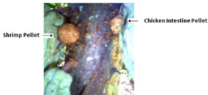
Figure 2. The attractiveness of shrimp pellet and chicken intestine pellet on the field

The ant attractiveness to the artificial diet in pellet formulation is provided in Table 1. This shows that the average number of rangrang attracted in artificial diet is the most significant in the shrimp pellet, followed by sugar pellet, chicken intestine pellet and the control.